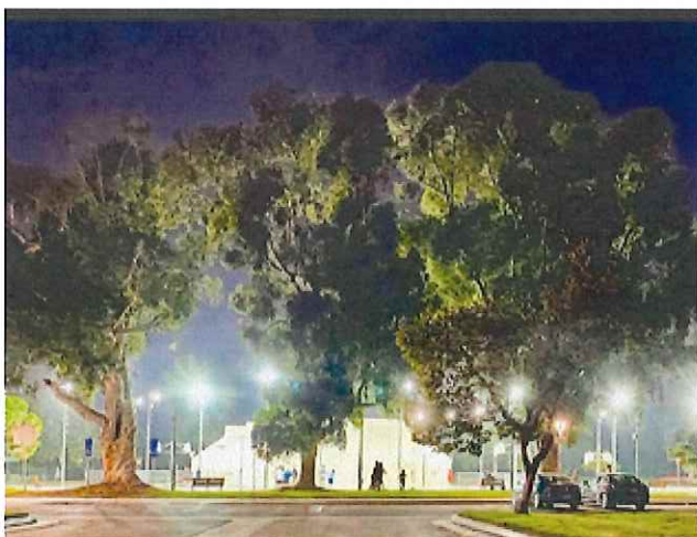
Those beautiful original trees at night...