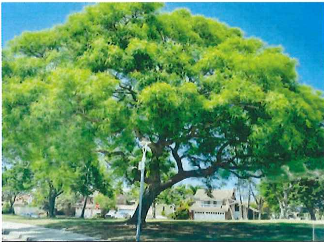
Trees that will be removed for new parking lot across from residents on Stillwell drive. These trees will be removed and so will the protection of lighting and noise for those folks living on Stillwell Dr.