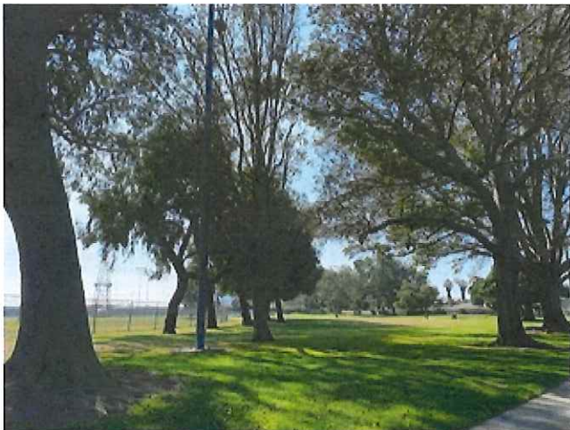
This entire group of trees is behind the fence line at E-1 and will need to be removed to allow for soccer fields.