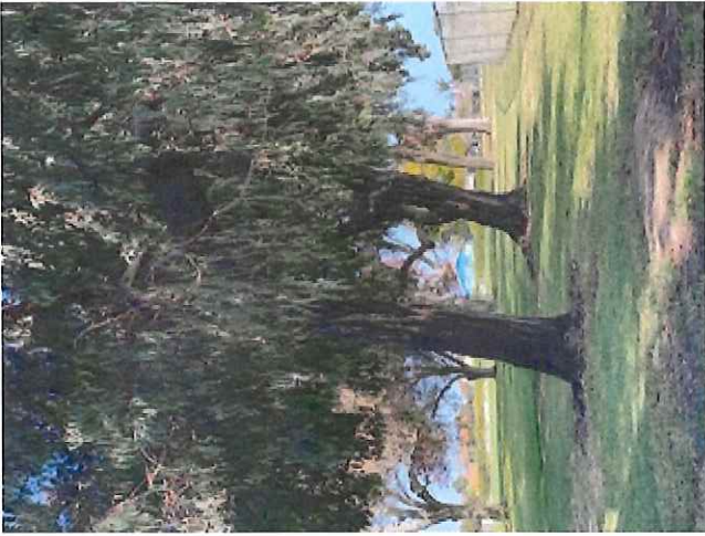
Trees behind the softball fields that will all be removed for soccer unless we angle the soccer fields.