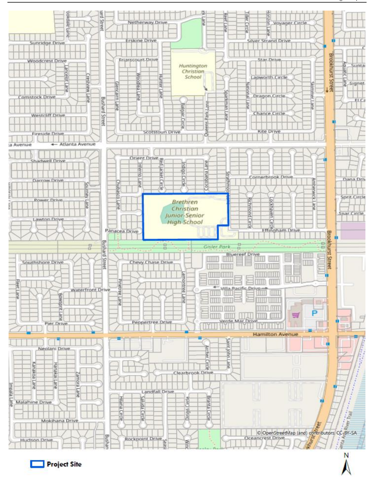
Figure 2, Local Vicinity