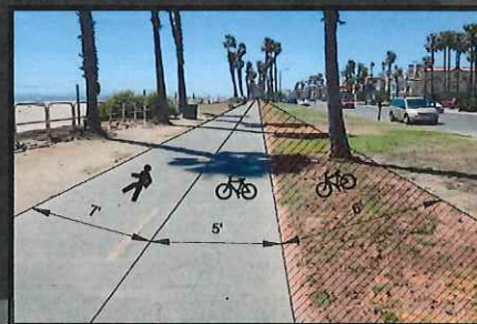
CONCEPTUAL TRAIL WIDENING