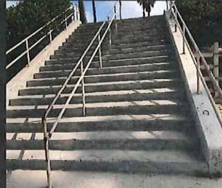
EXISTING RAILING STAIRWAYS