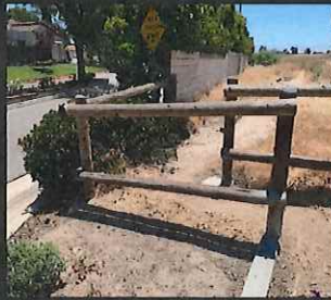
NEW LODGE POLE RAILING