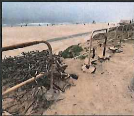
EXISTING RAILING BLUFFTOP