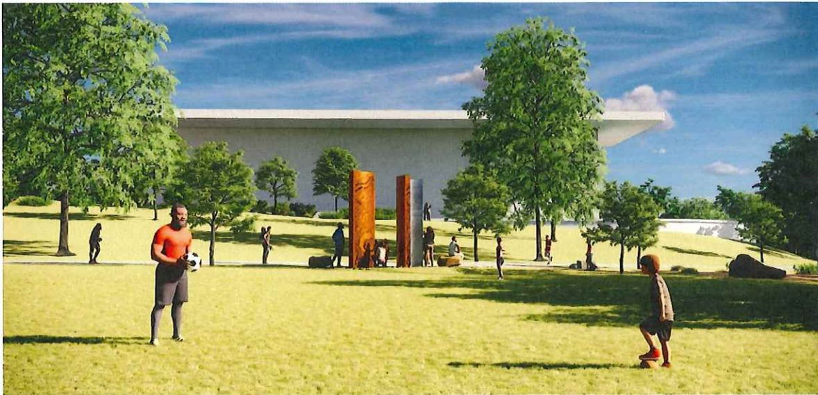
"To See Yourself in Nature..." Evening View