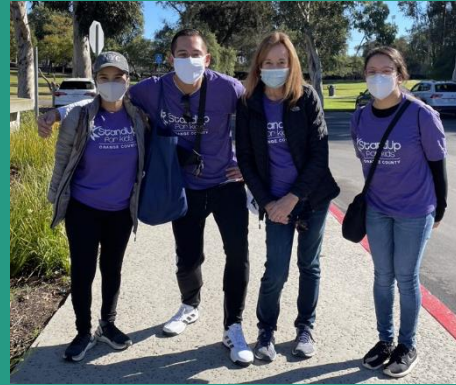
StandUp for Kids OC