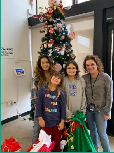
Homeless Outreach Services