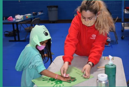
Oak View Children's Bureau