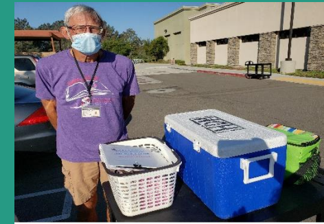
Senior Care Services