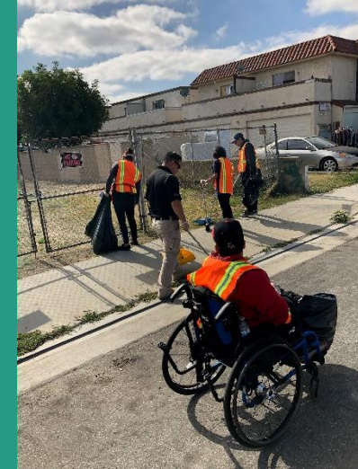
Special Code Enforcement