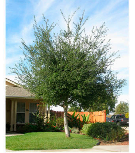
Coast Live Oak (Native) Quercus agrifolia