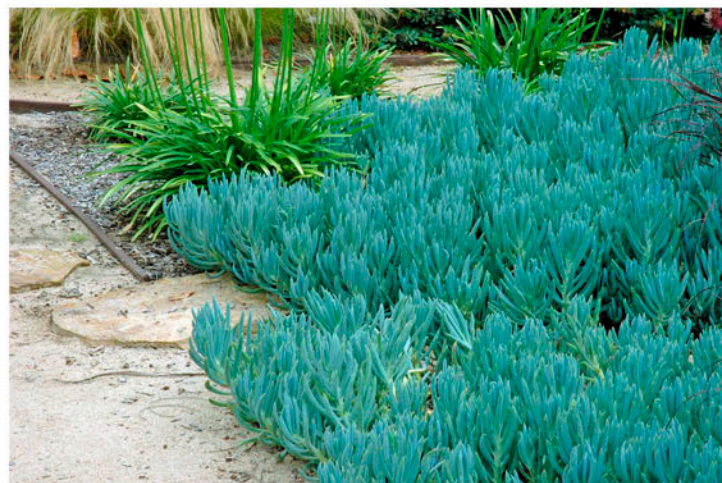
Blue Chalk Sticks Senecio mandraliscae 10/02/2020