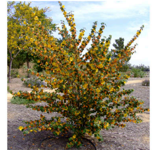
Flannel Bush (Native) Fremontodendron 'Cal. Glory'