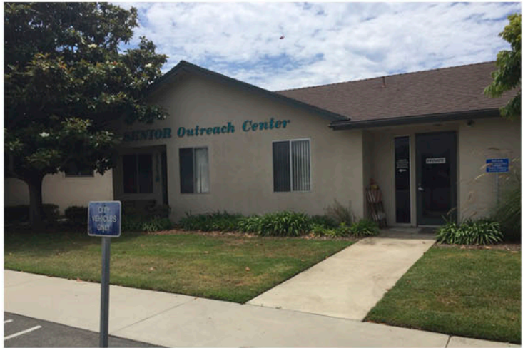
PARKING AREA FRONTAGE OF OUTREACH CENTER