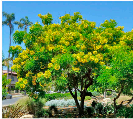
Gold Medallion Tree Cassia leptophylla