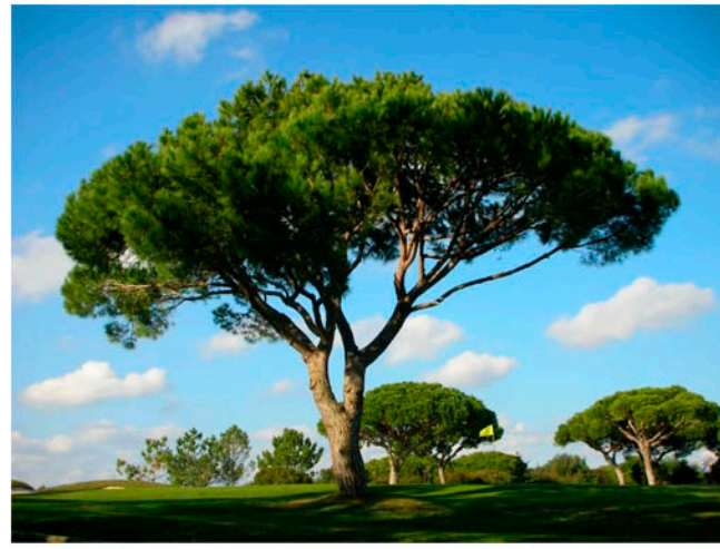
Italian Stone Pine Pinus pinea