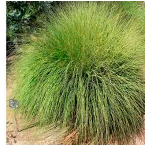
Deer Grass (Native) Muhlenbergia rigens