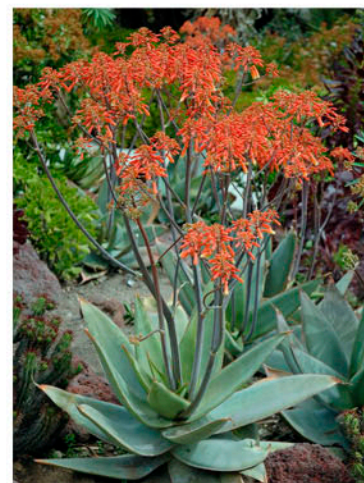
Coral Aloe Aloe striata