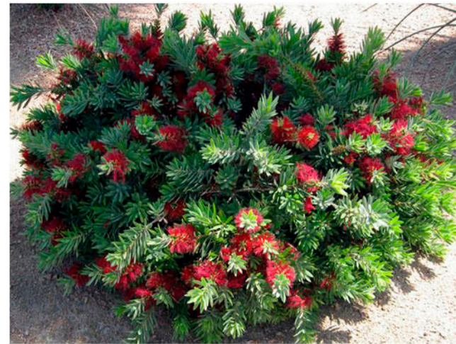
Dwarf Bottlebrush Callistemon 'Little John'