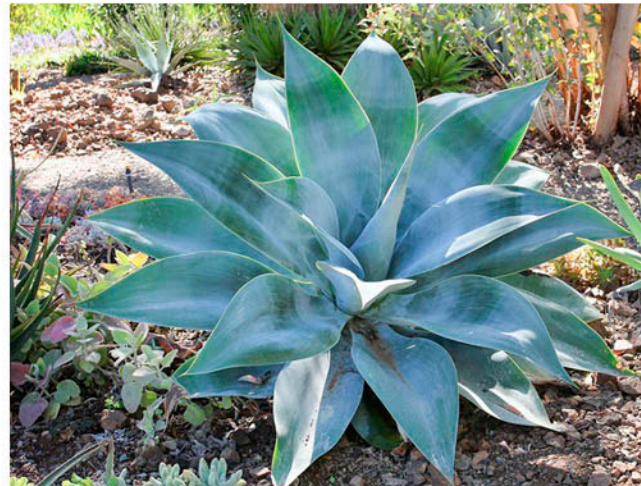
Blue Foxtail Agave Agave attenuata 'Boutin Blue'