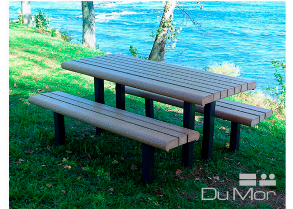
PICNIC TABLE (USED AT WORTHY PARK)