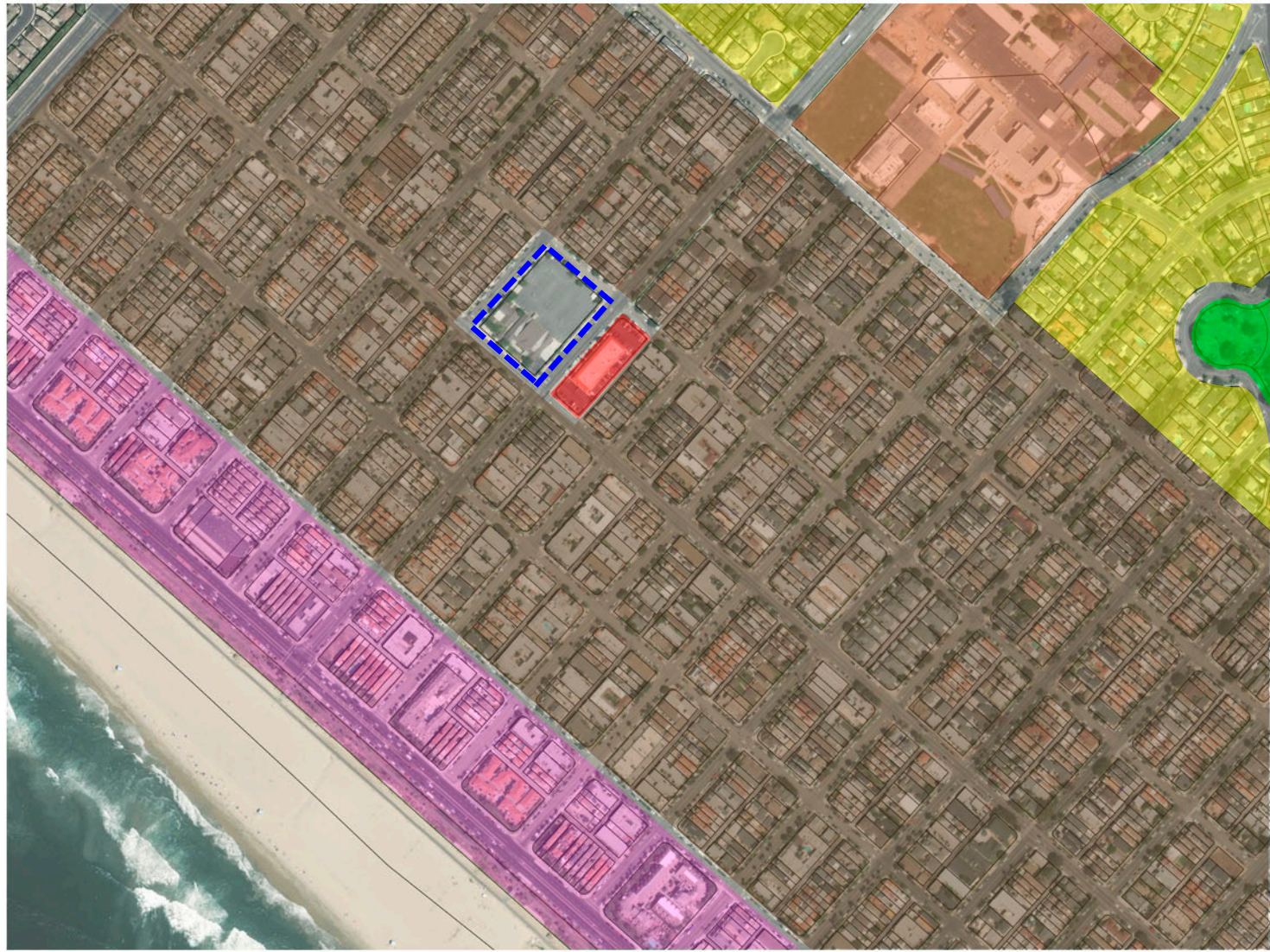
PROJECT SITE / ADJACENT ZONING