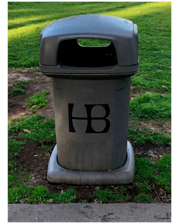
TRASH / RECYCLING RECEPTACLE (NEW CITY STANDARD)