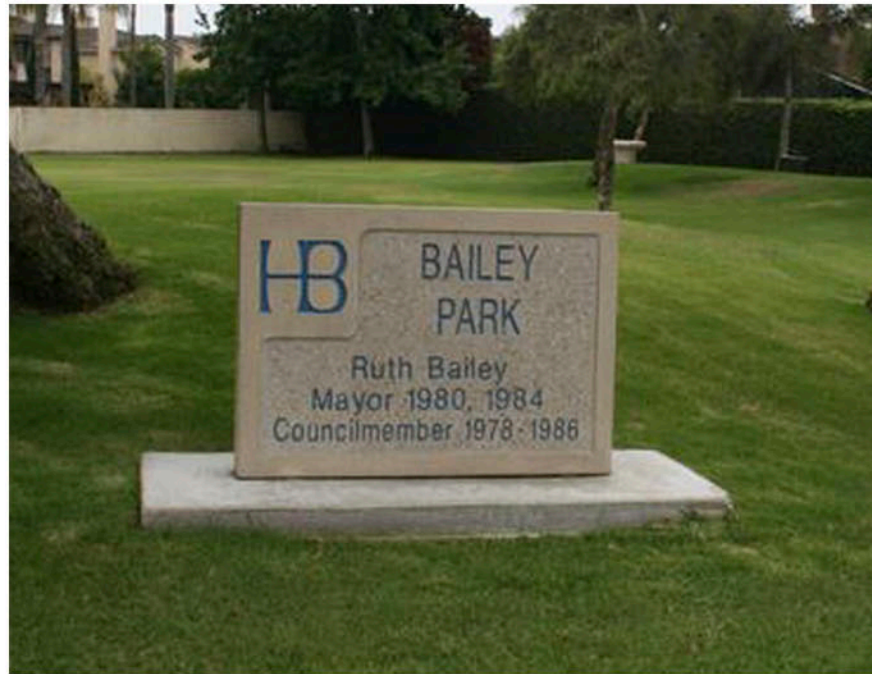
PARK MONUMENT SIGN (CITY STANDARD)