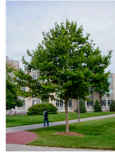
London Plane Tree Platanus 'Columbia'