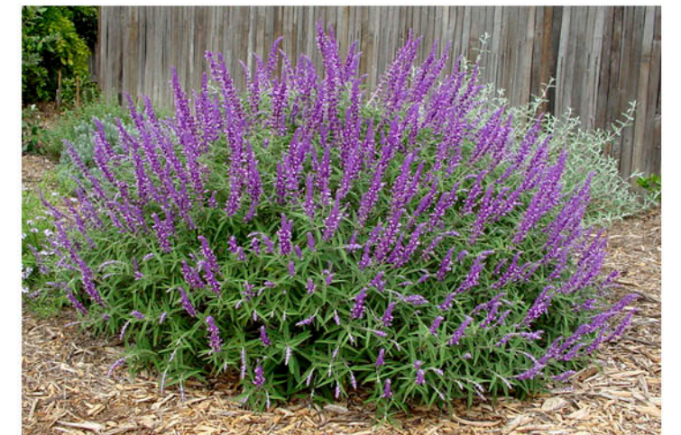
Mexican Bush Sage (Native) Salvia 'Santa Barbara'