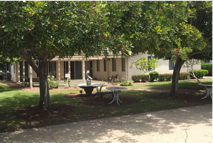
COURTYARD AREA OF OUTREACH CENTER