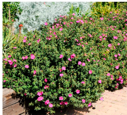
Dwarf Rockrose Cistus 'Sunset'