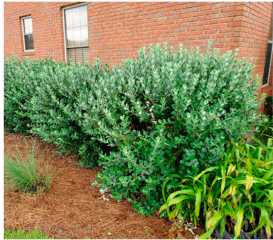
Pineapple Guava Acca sellowiana