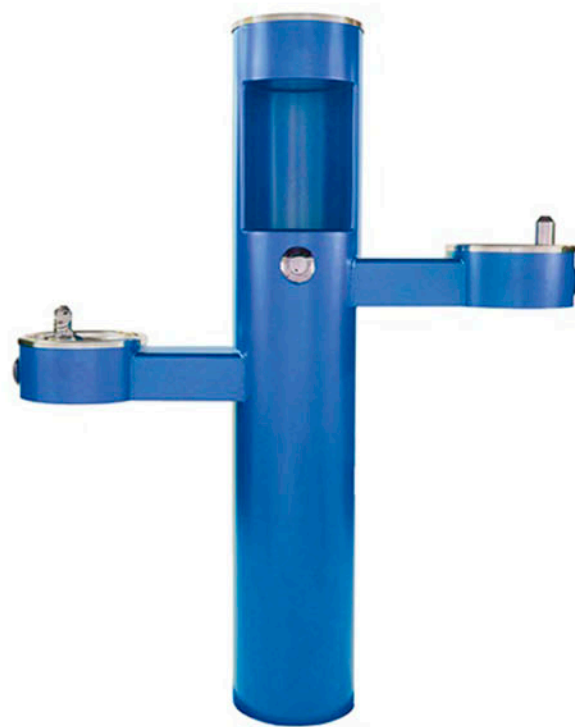
DRINKING FOUNTAIN / BOTTLE FILLER