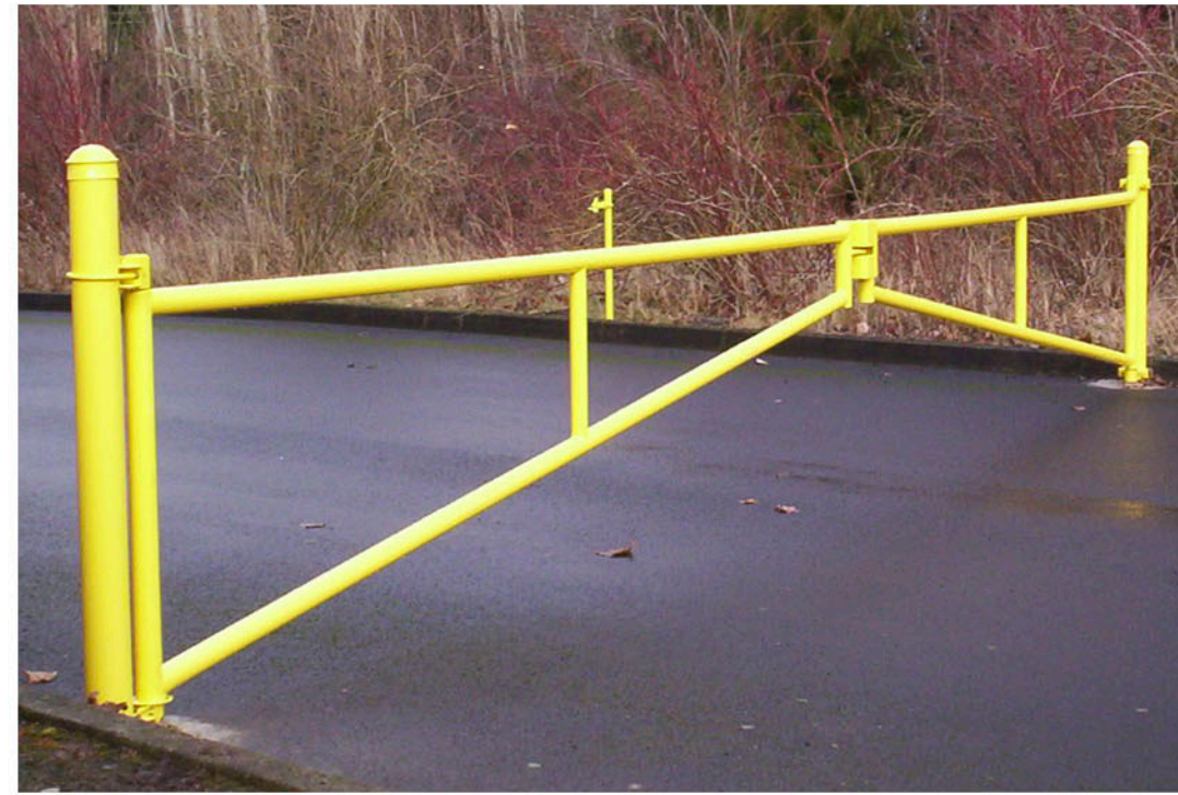
VEHICULAR GATE (LOCATED AT PARKING AREA ENTRANCE)