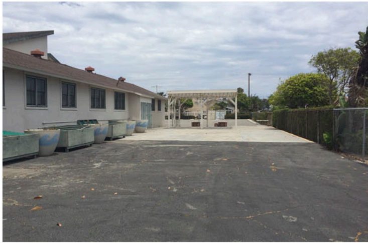
OPEN AREA SW OF RECREATION CENTER