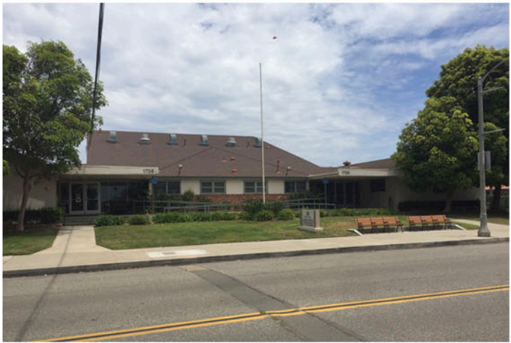
ORANGE ST. FRONTAGE OF RECREATION CENTER