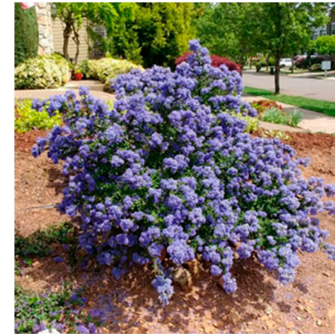
California Lilac (Native) Ceanothus 'Dark Star'