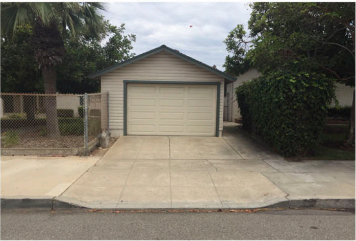
ORANGE ST. FRONTAGE OF STORAGE GARAGE