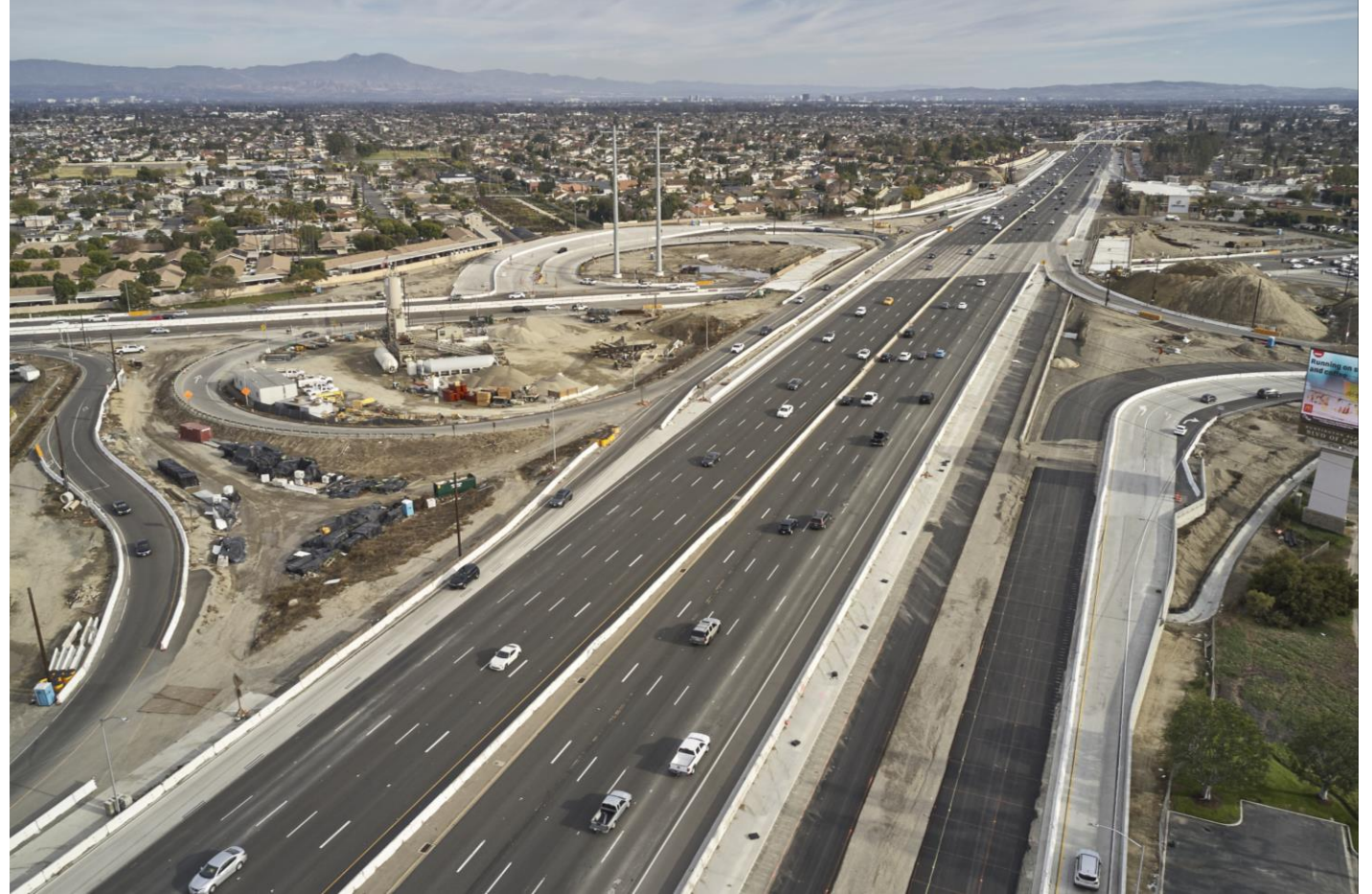
Beach Boulevard construction