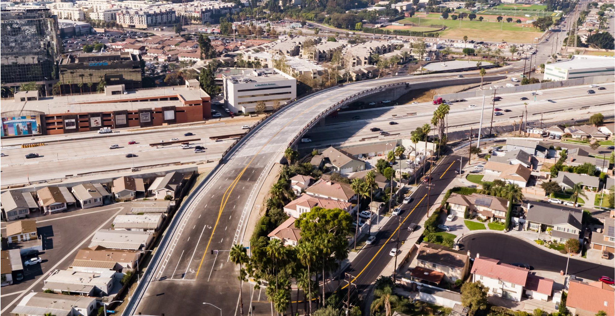
McFadden Avenue bridge complete