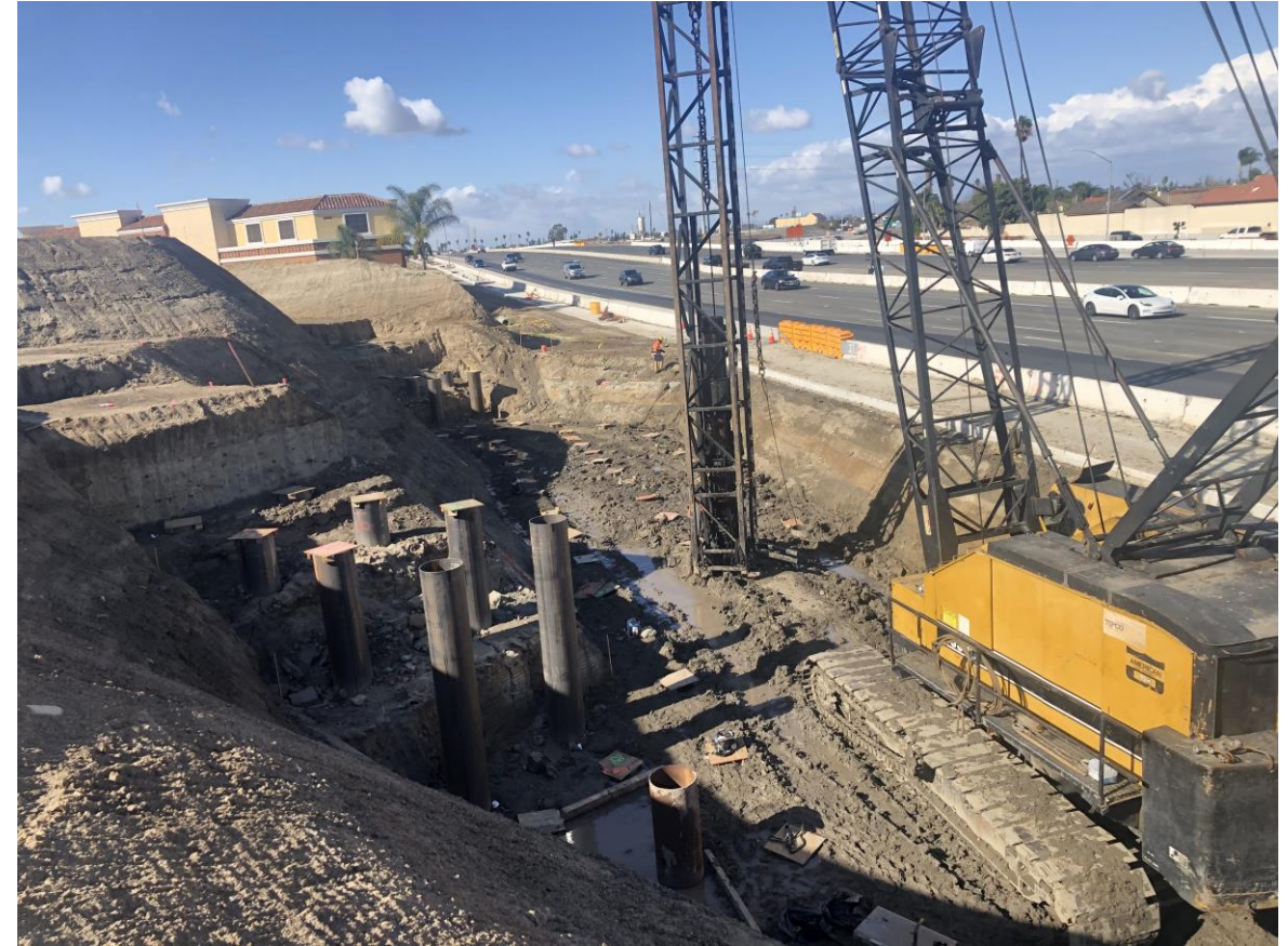
Edinger Avenue bridge construction