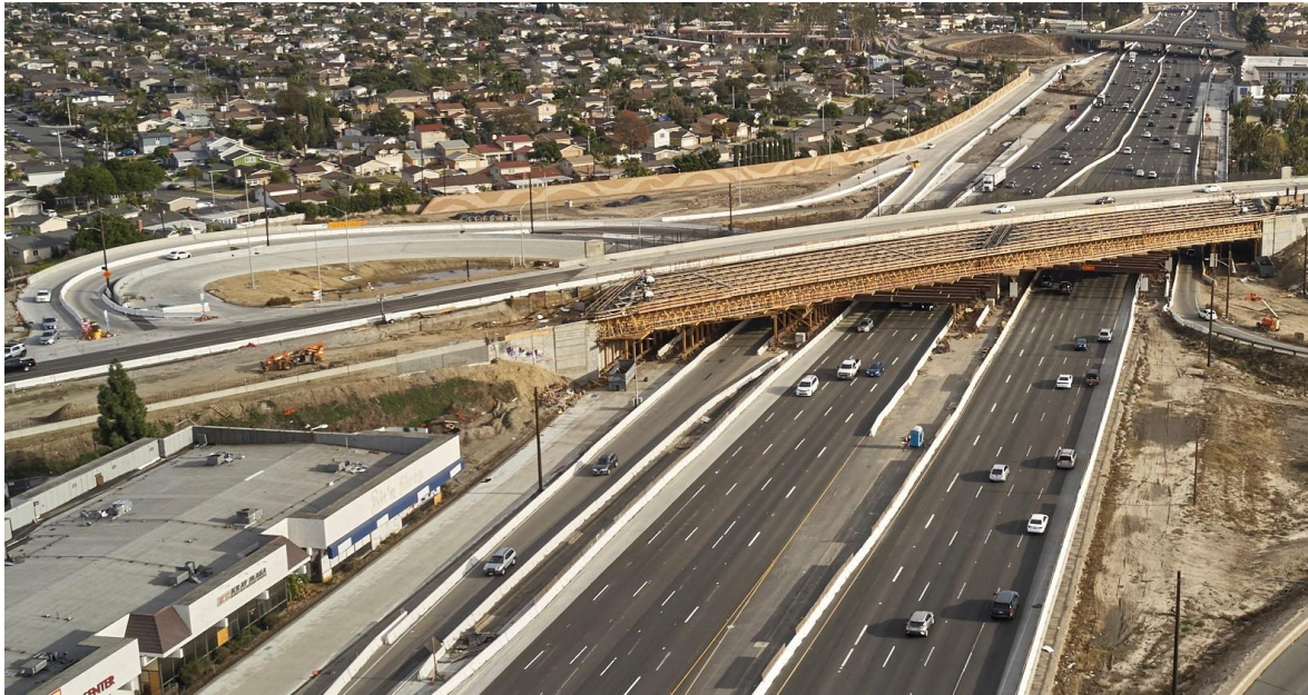
Magnolia Street bridge construction