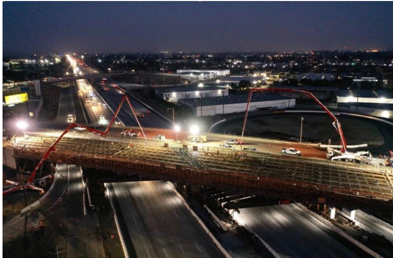
Bolsa Avenue bridge construction