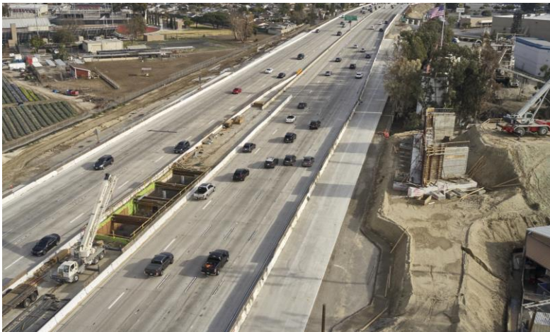
Edwards Street bridge construction