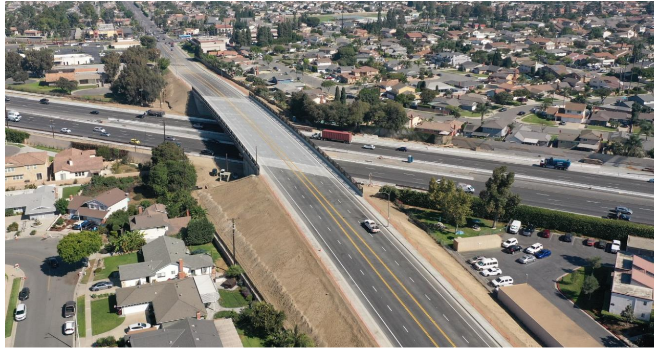
Bushard Street bridge complete