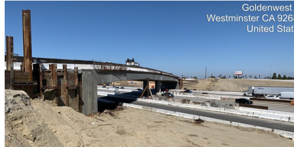
Goldenwest Street bridge construction