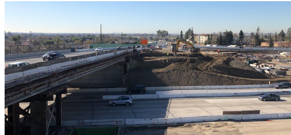
Bolsa Chica Road bridge construction