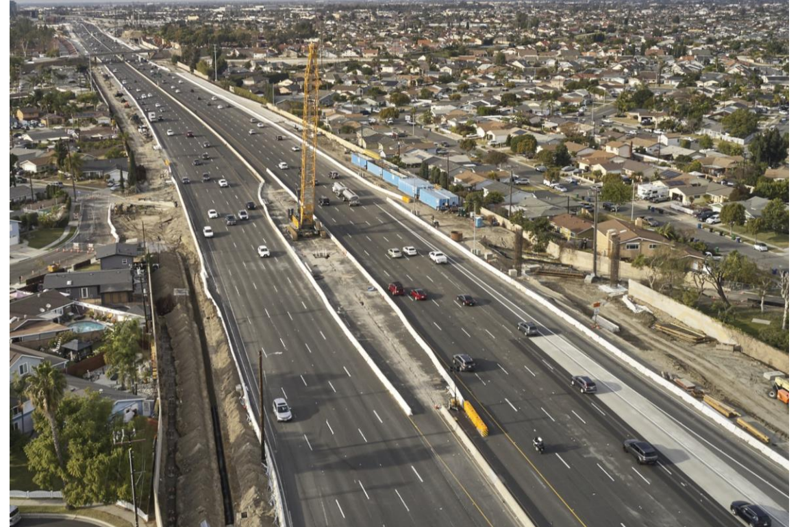
Heil Avenue pedestrian overcrossing construction