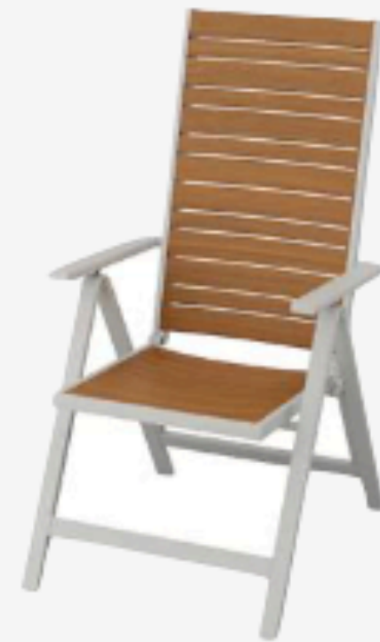
RECLINING CHAIR - OUTDOOR *NATURAL/WHITE