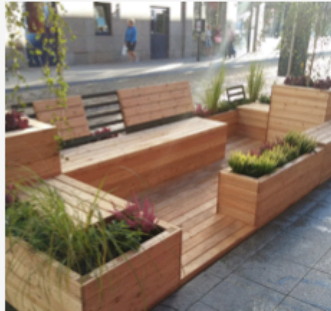
2' BENCH CONCEPT