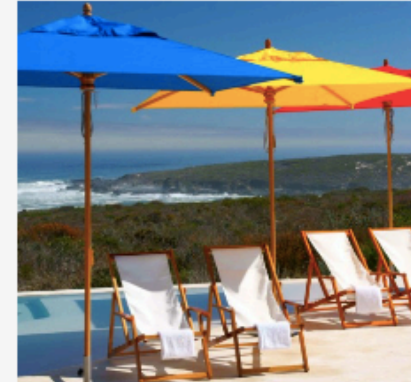
MARKET UMBRELLAS MULTIPLE COLORS