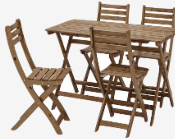
ASHLYN DINNING SET LARGE