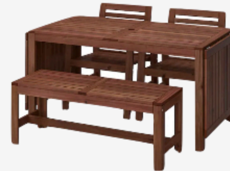
CHARLIE DINNING SET *BENCH