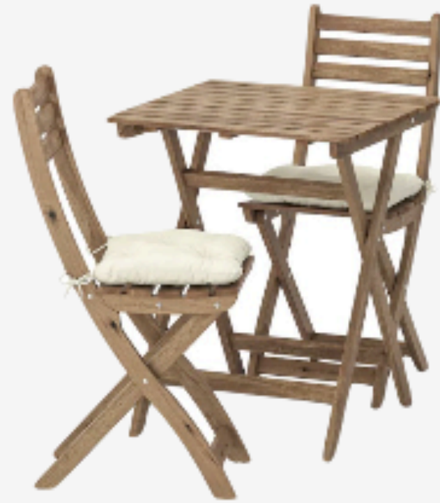
ASHLYN DINNING SET SMALL