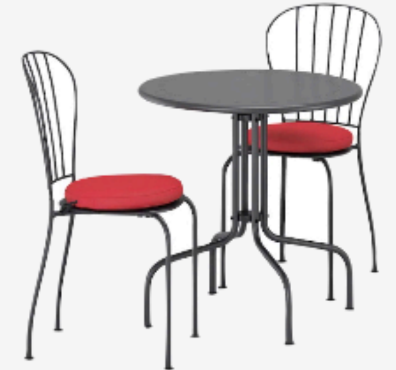
BISTRO TABLE *BLACK/RED