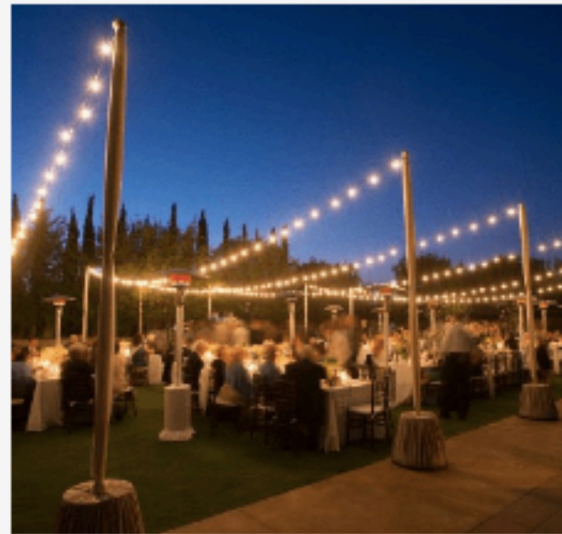
BISTRO LIGHTING STRANDS W/ BASE