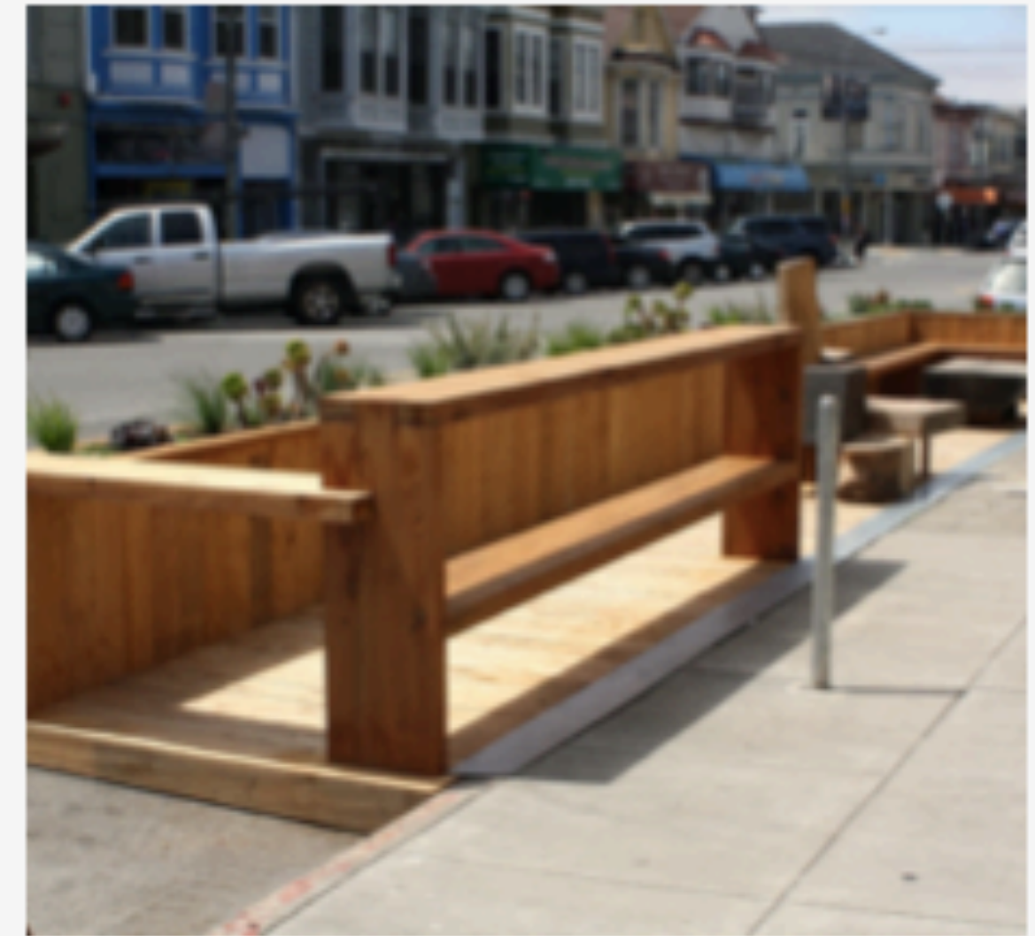
BEAM AND PLANK