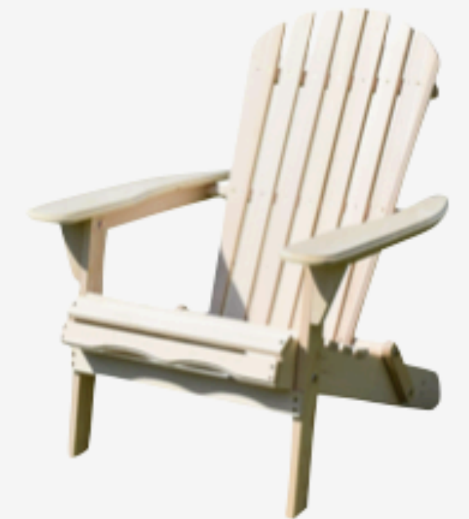
ADIRONDACK CHAIR NATURAL OR WHITE