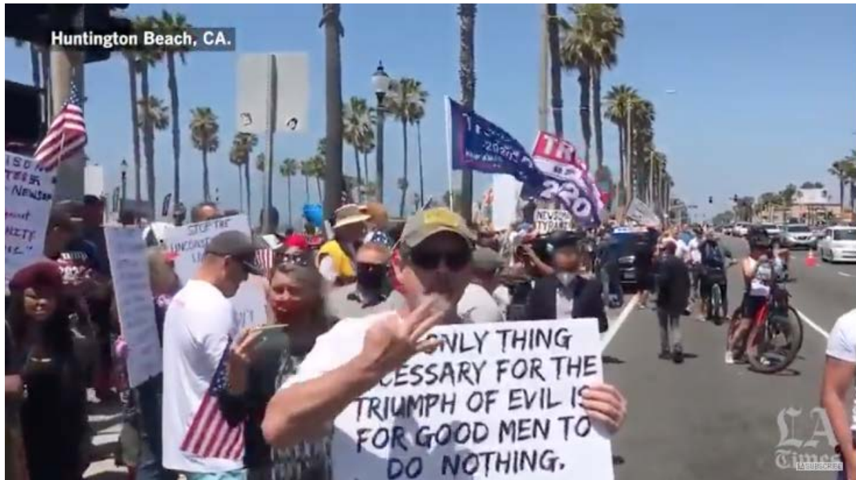
Lyn Semeta/Trump Rally - Huntington Beach, CA © LA Times May 1, 2020 Man displaying the "White Power" symbol in front of Trump 2020 rally flags at Lyn Semeta/Trump Rally in Huntington Beach, California.

I don't know what your political calculus is to foment these hate rallies with Trump followers and white supremacists but 70% of Americans are in agreement with sheltering in place and beating this disease, the same policies Governor Gavin Newsom is advocating.