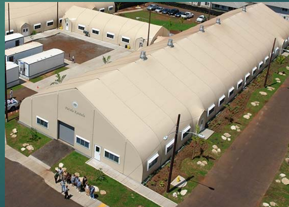
Homeless Shelter Tent Structure (conceptual)