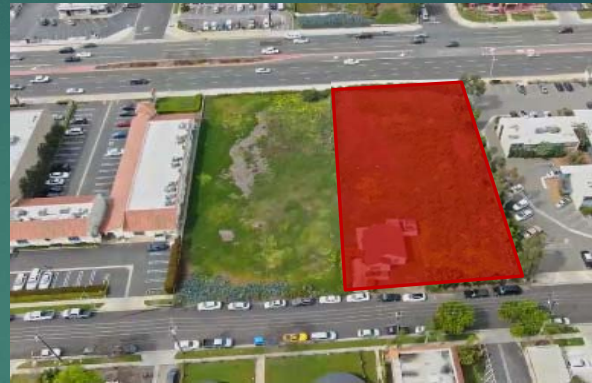
Homeless Shelter Site 17631 Cameron Lane