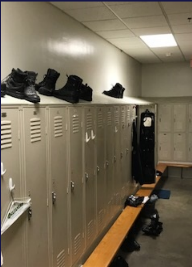
Overcrowded locker room