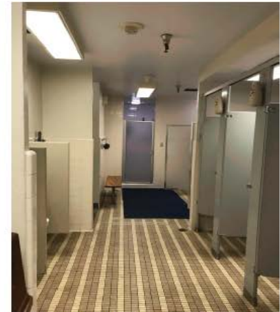
EXISTING RESTROOMS ARE OUTDATED

EXISTING CONDITIONS AND ISSUES - 1971 BUILDING - LOCKERS AND RESTROOMS