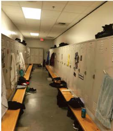
WOMEN'S LOCKERS - TOO SMALL, BAD LOCATION