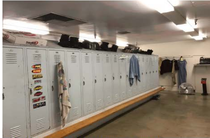
MEN'S LOCKER ROOM - OUTDATED, POOR VENTILATION, TOO SMALL