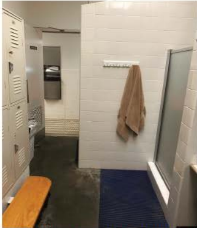
WOMEN'S LOCKERS - TOO SMALL, BAD LOCATION