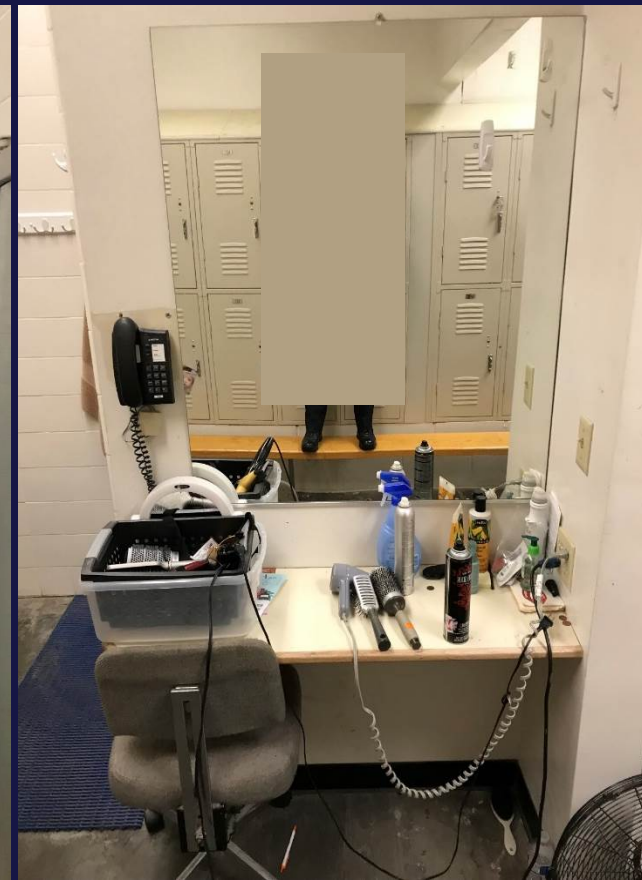
Two sinks / One counter