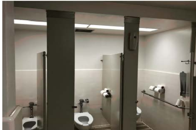
NO ADA ACCESS IN CURRENT RESTROOMS