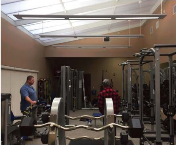
TRAINING/ EXERCISE ROOM