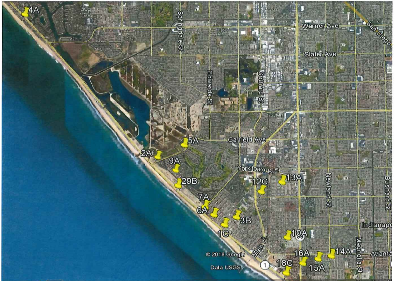
AT&T Overall Location Map