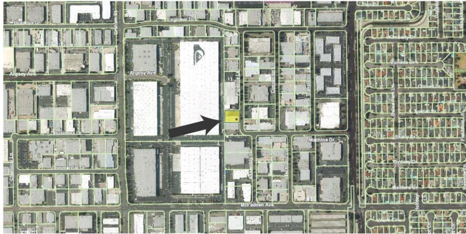
15311 Pipeline Lane, Huntington Beach