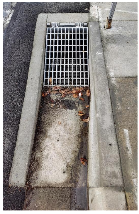
Before & After - Orange Avenue @ 17th Street