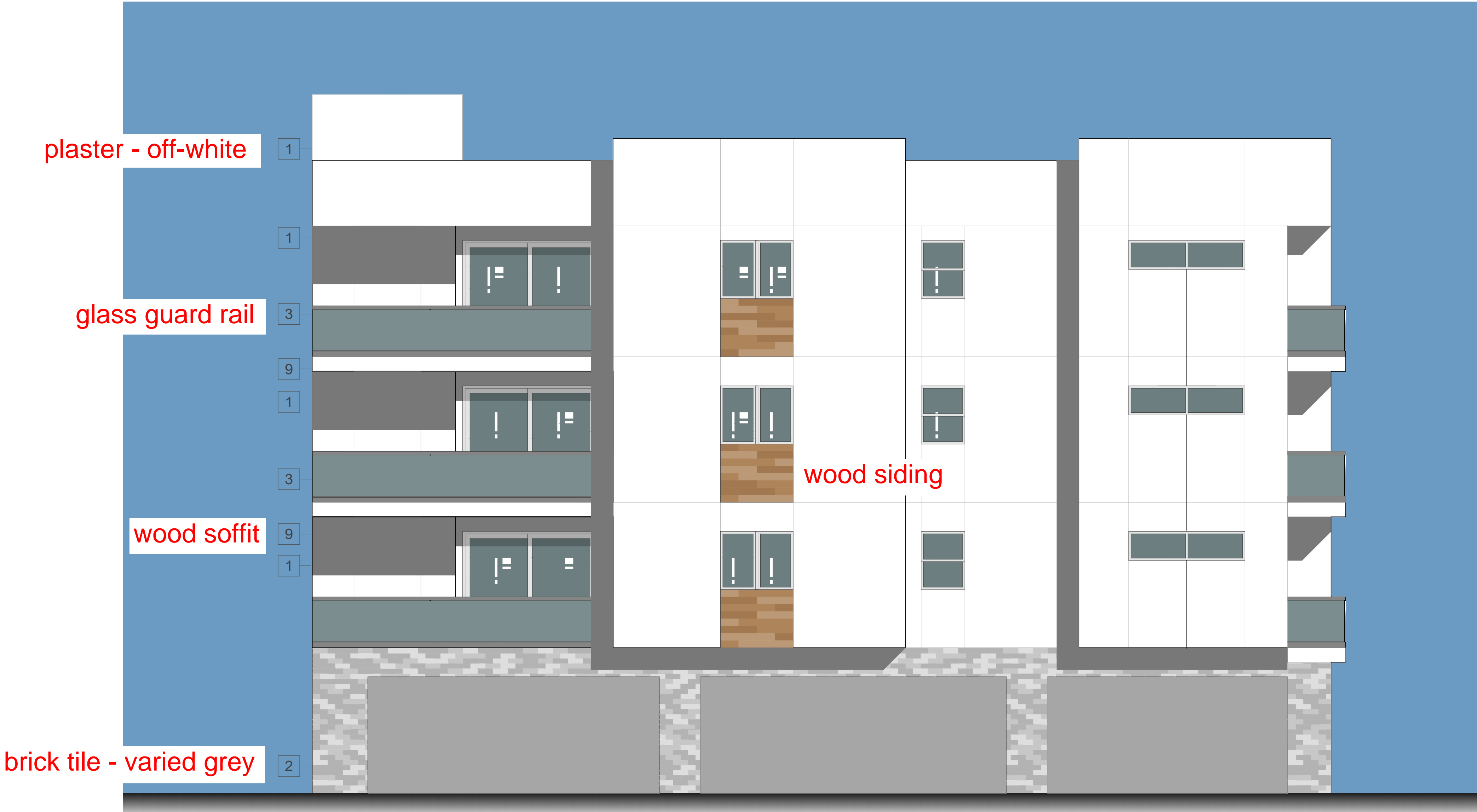
NORTH ELEVATION ( ALLEY )