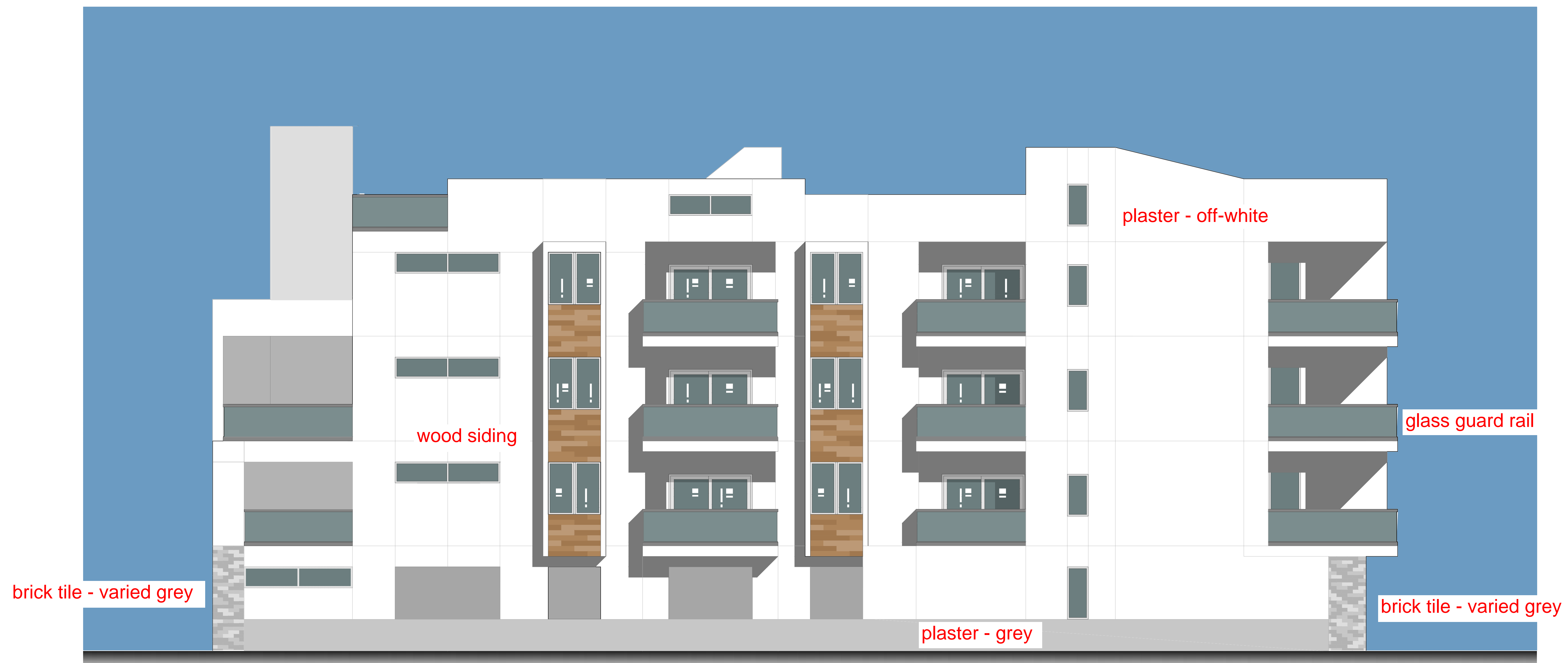
EAST ELEVATION ( SIDE )