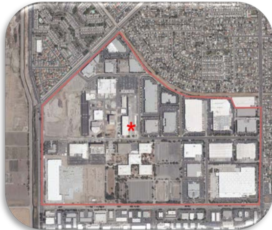
McDonnell Centre Business Park Specific Plan (SP 11)