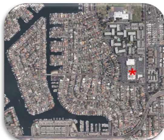
Huntington Harbour Mall