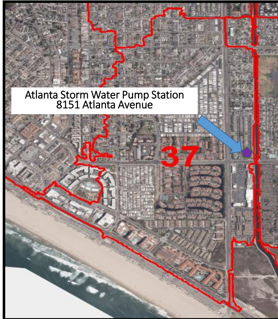
Atlanta Storm Water Pump Station Drainage Area (#37)