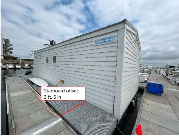
Photograph 7 Starboard Side of Floating Restroom