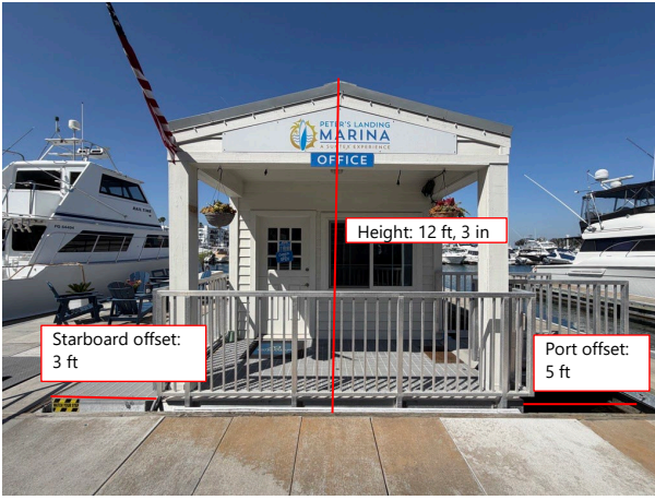
Photograph 1 Bow of Marina Office