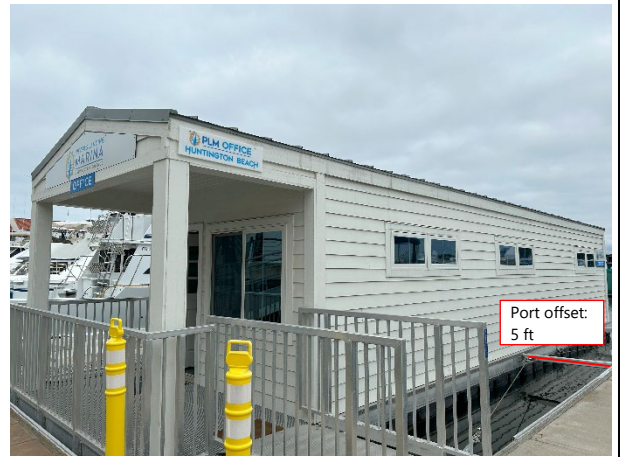
Photograph 4 Port Side of Marina Office