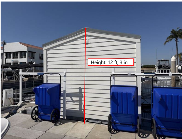
Photograph 5 Bow of Floating Restroom