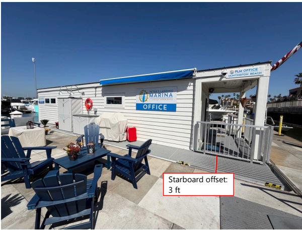
Photograph 3 Starboard Side of Marina Office