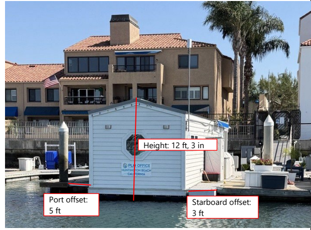
Photograph 2 Stern of Marina Office