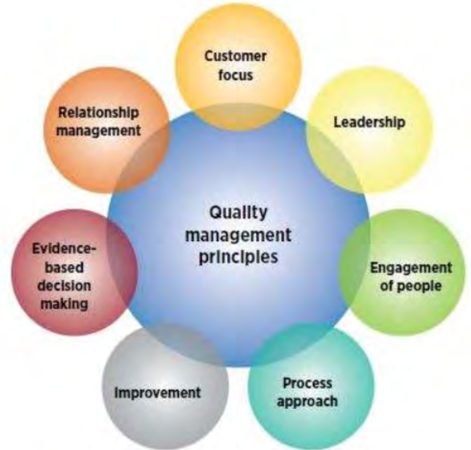
The Seven Principles of ISO 9001:2015

A Quality Management System provides customers the reassurance that the organization values and practices quality management principles.