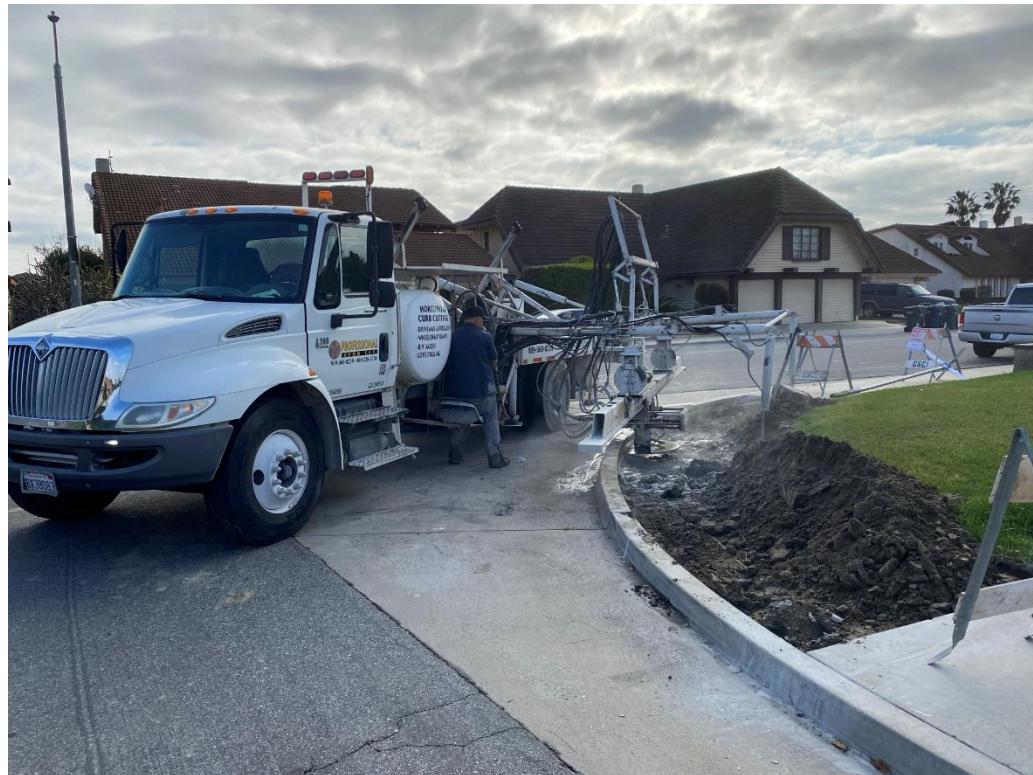
Curb Ramp Construction