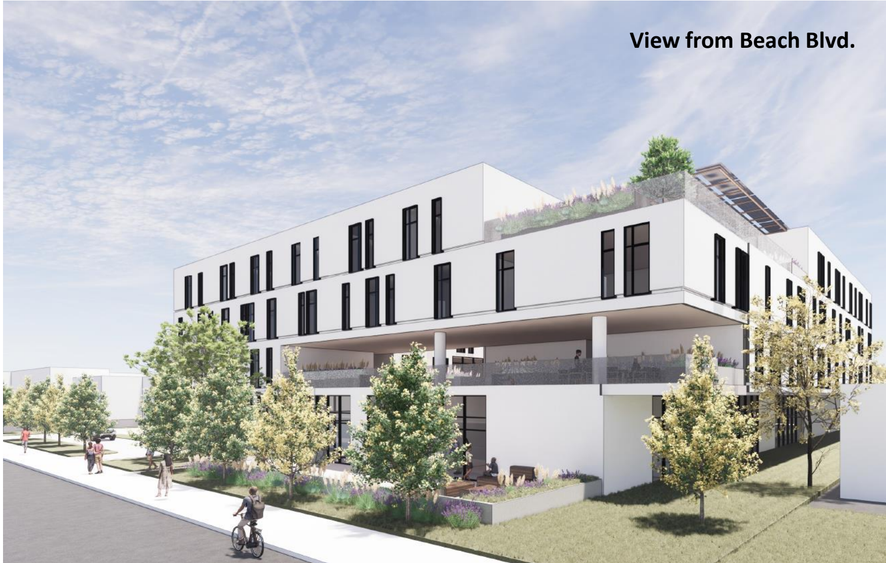
View from Beach Blvd.

4 level structure with 30' setback from Beach Blvd.