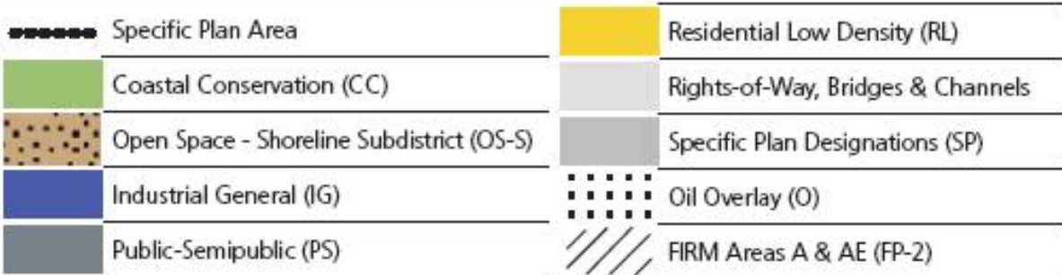
Existing Zoning Map