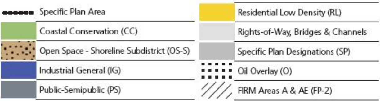
Proposed Zoning Map