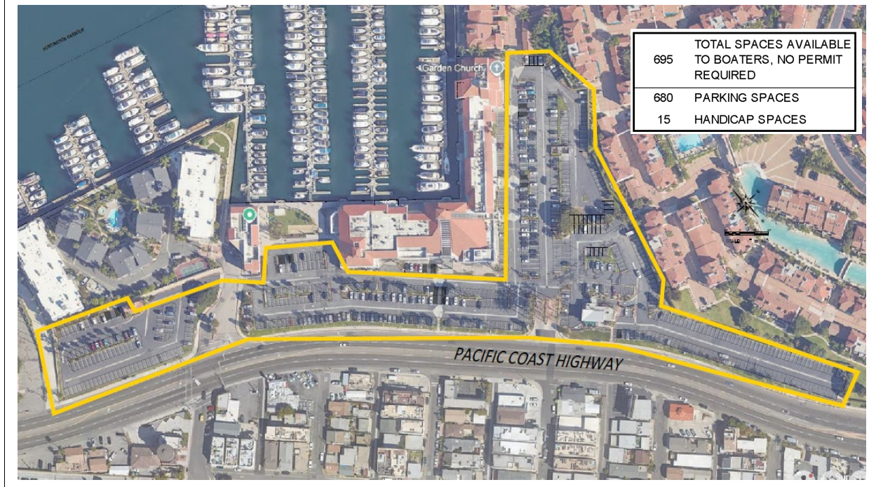
Figure 1 Peter's Landing Parking Spaces