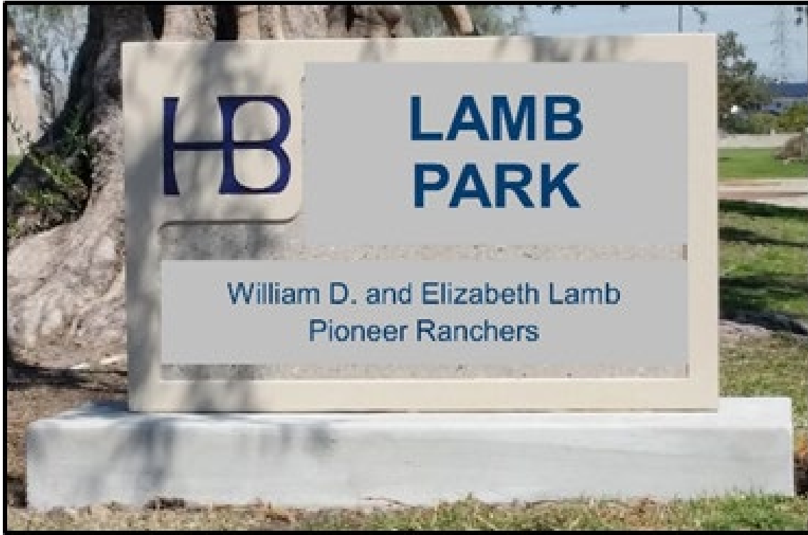
Standard Park Identification Sign Mock-up