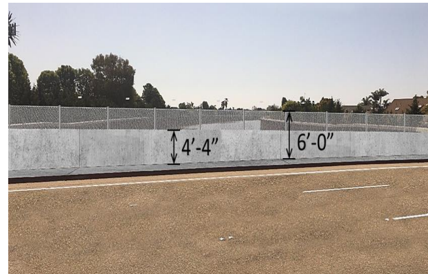
Flood Wall Rendering