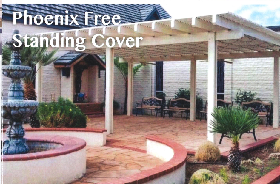
Phoenix Free Standing Cover

||| Get started on that dream TODAY! |||