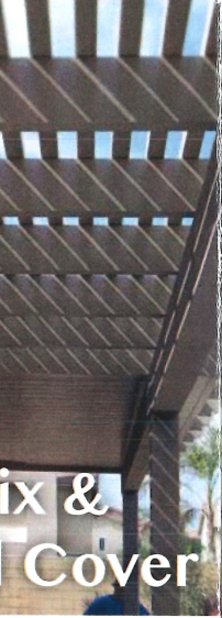
ix & Cover