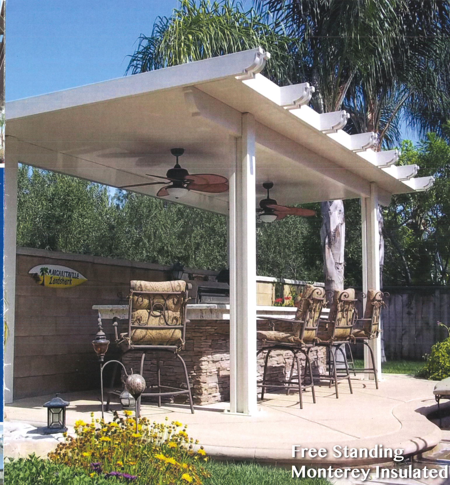
Free Standing Monterey Insulated

The Weatherwood™ Monterey is the perfect choice for a beautiful Patio Cover that makes a statement! Adding fans and lighting to your project further increases the enjoyment of your covered space.