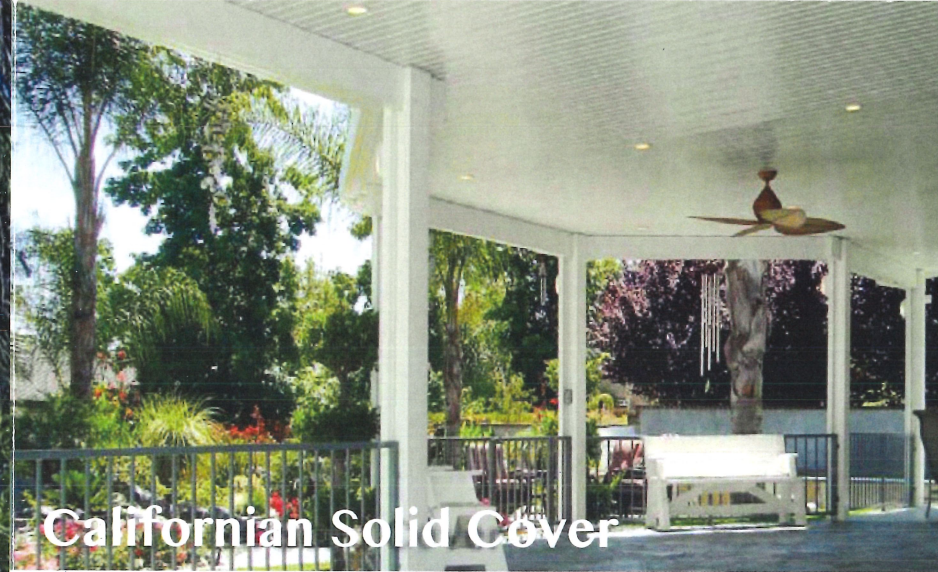
Californian Solid Cover