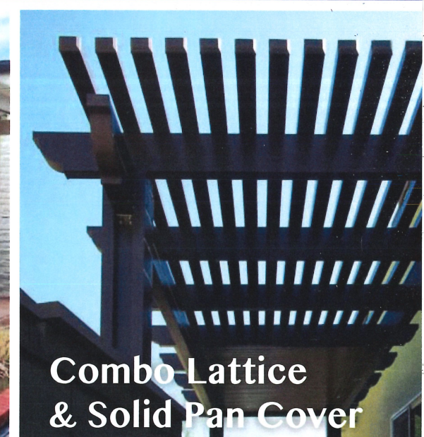
Combo Lattice & Solid Pan Cover