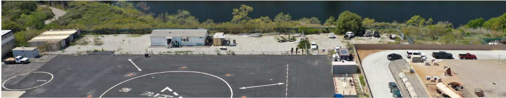
PROPOSED TRAINING FIELD