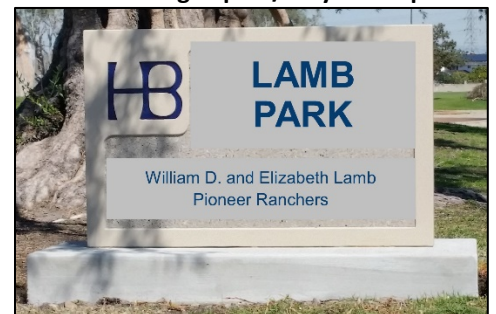
Prominent Person Sample